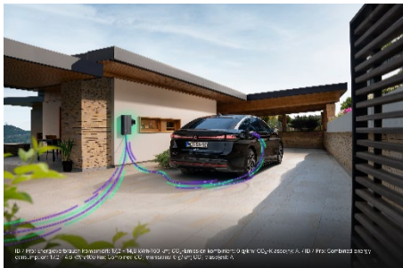
A Volkswagen ID.7 connected to the Elli BiDi Charger: bidirectional charging integrates the vehicle battery into the energy system and can help reduce mobility costs.

Wolfsburg/Munich, June 23, 2026 - Volkswagen Group subsidiary Elli is taking the next major step for the energy ecosystem of electric vehicles and is bringing Vehicle-to-Grid charging to market maturity. Together with the brands Volkswagen, Volkswagen Commercial Vehicles and CUPRA, Elli is presenting at Power2Drive, the international leading trade fair for electric mobility in Munich, how bidirectional charging can soon be translated into a scalable, customer-focused offer that is integrated into the energy industry. The new product package is initially aimed at customers in Germany and consists of an Elli BiDi Charger, Volkswagen Naturstrom V2G Flow tariff and the Elli BiDi App, which enables access to the energy market. From the start of the trade fair, interested customers can register their interest for the offer.